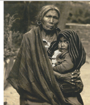
Ron Turner Old Lady and Child, Photographs of Mexico , 1980

In celebrating the renewed vitality of the Bronx art community, this exhibition showcases a multitude of approaches to living and working as an artist in the Bronx. In an attempt to show the great diversity of Bronx art, this show samples work on oil painting, metal sculpture, lithography, collage, watercolor, and photography by nine past recipients of the Bronx Council on the Arts' prestigious BRIO Award.