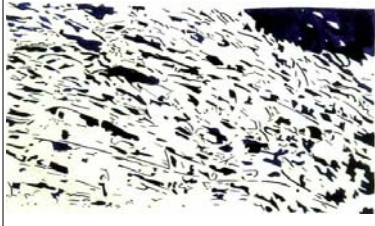
Beth Brideau 24000'1, 2003 Watercolor on paper, 4 x 6 inches

Krasdale Art Gallery Exhibit features work by nine BRIO Artists