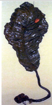
Helene Brandt Budding Leaf, 2005 Reinforced leaf, root, seed pod, springs, steel -- 30 x 11 5 inches