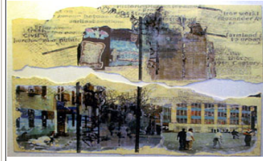
Linda Cunningham South Bronx Saga 2, 2005 Transfer, graphite