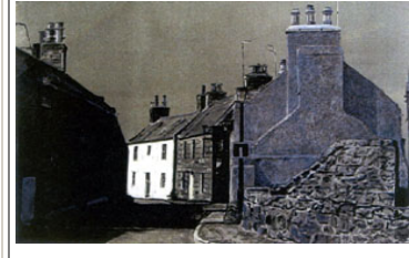
Agnes Murray Roanheads, 2005 Monoprint, 20 x 26 inches