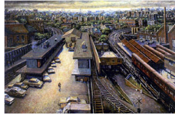
Daniel Hauben View from Bx River Parkway III, 2005 Oil on Canvas, 16 x 20 inches