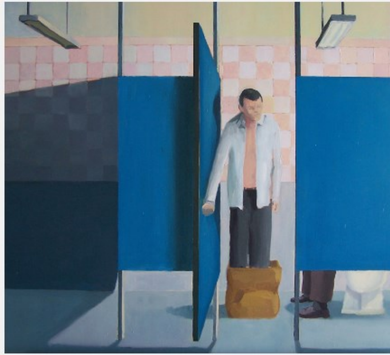
The Opportunists , an oil painting by Steve Locke, 2007.

"Up until 1973, being gay was considered a mental disorder," he remarked. "But very recently, there have been great achievements in the community, such as gay marriage and the repeal of 'Don't ask, don't tell' to allow gays to serve in the military."