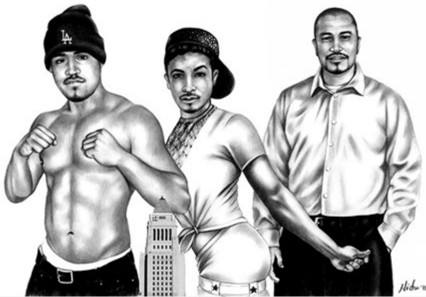
Los Hijos de Doña Rita , a pencil drawing by artist Hector Silva, 2011.

The upcoming exhibition will include a health fair featuring local, community-based organizations that provide services to gay men of color.